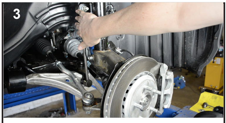
Remove sway bar links and ball joint.