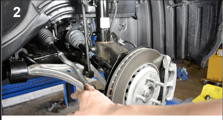
Remove brake caliper and disconnect tie rod.