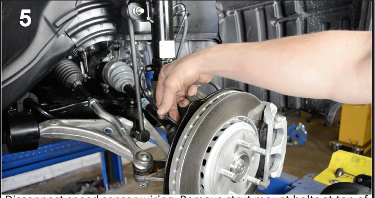
Disconnect speed sensor wiring. Remove strut mount bolts at top of strut, behind plastic cover. Remove lower strut mount bolt.

OPTION - grind bolt threads down 1/2" while leaving bolt installed.