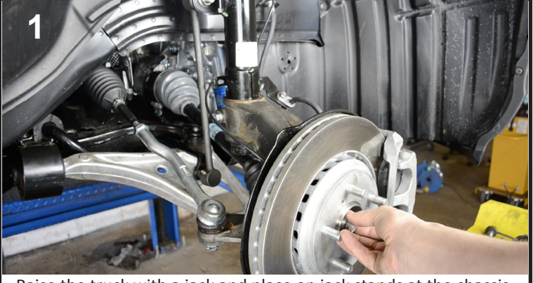
Raise the truck with a jack and place on jack stands at the chassis. Remove wheels and tires. Remove axel nut.