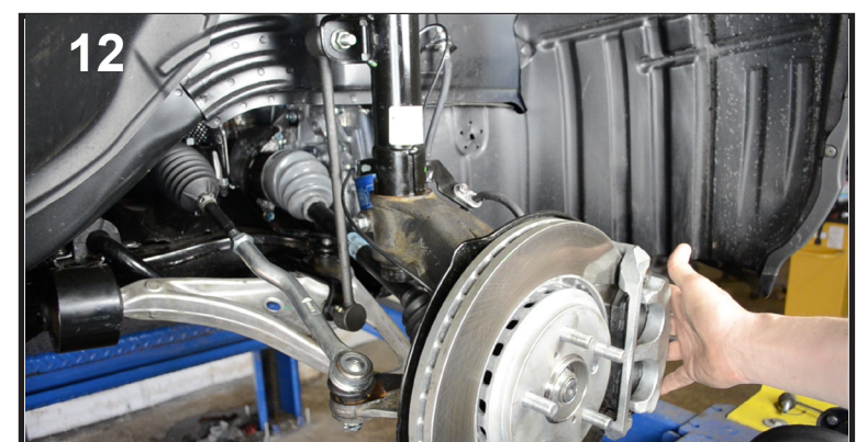
Install brake caliper. Install tie rod, ball joint, speed sensor wire, and axel nut. This is a reversal of the removal process.