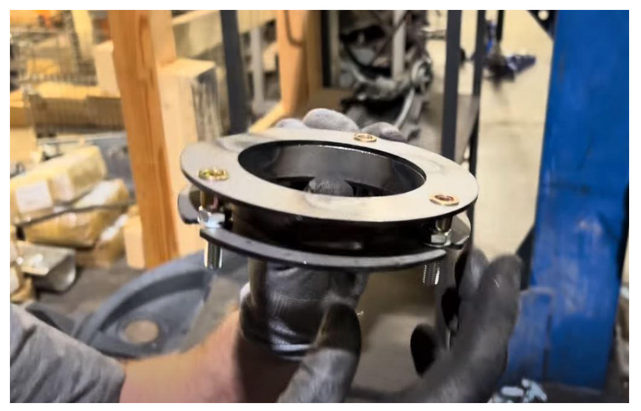
12. Reinstall strut to vehicle, loosely tightening the three OEM bolts into the top for now.