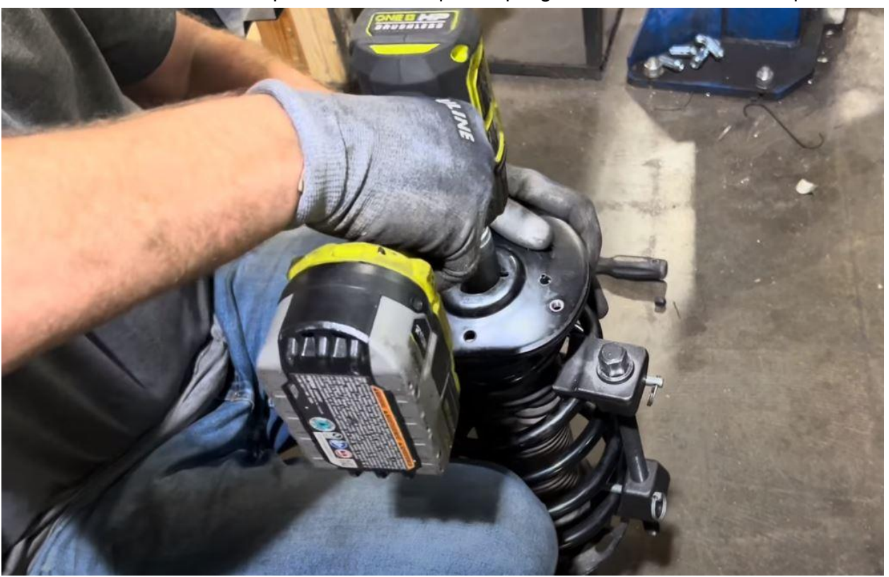
10. Tighten top nut fully.

9. Reattach the black metal top to the strut, compress springs more and reattach the top nut.