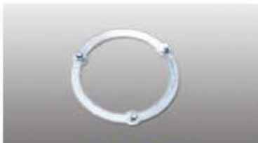
Figure B: Crown