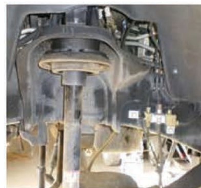
Figure C: Reinstalling strut with TRAXDA strut cap

Always use caution when handling ABS or wheel sensor wiring. Avoid tension of any kind on wiring harness as this may cause damage or failure.