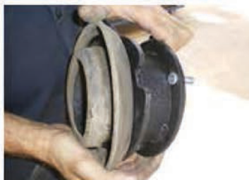
Figure A: Installing isolator pad on TRAXDA spacer

4) Lower the truck down to seat the springs. Reinstall the shocks and tighten the shock tower. Reconnect the sway bar link and reconnect the track bar. Retorque all hardware.