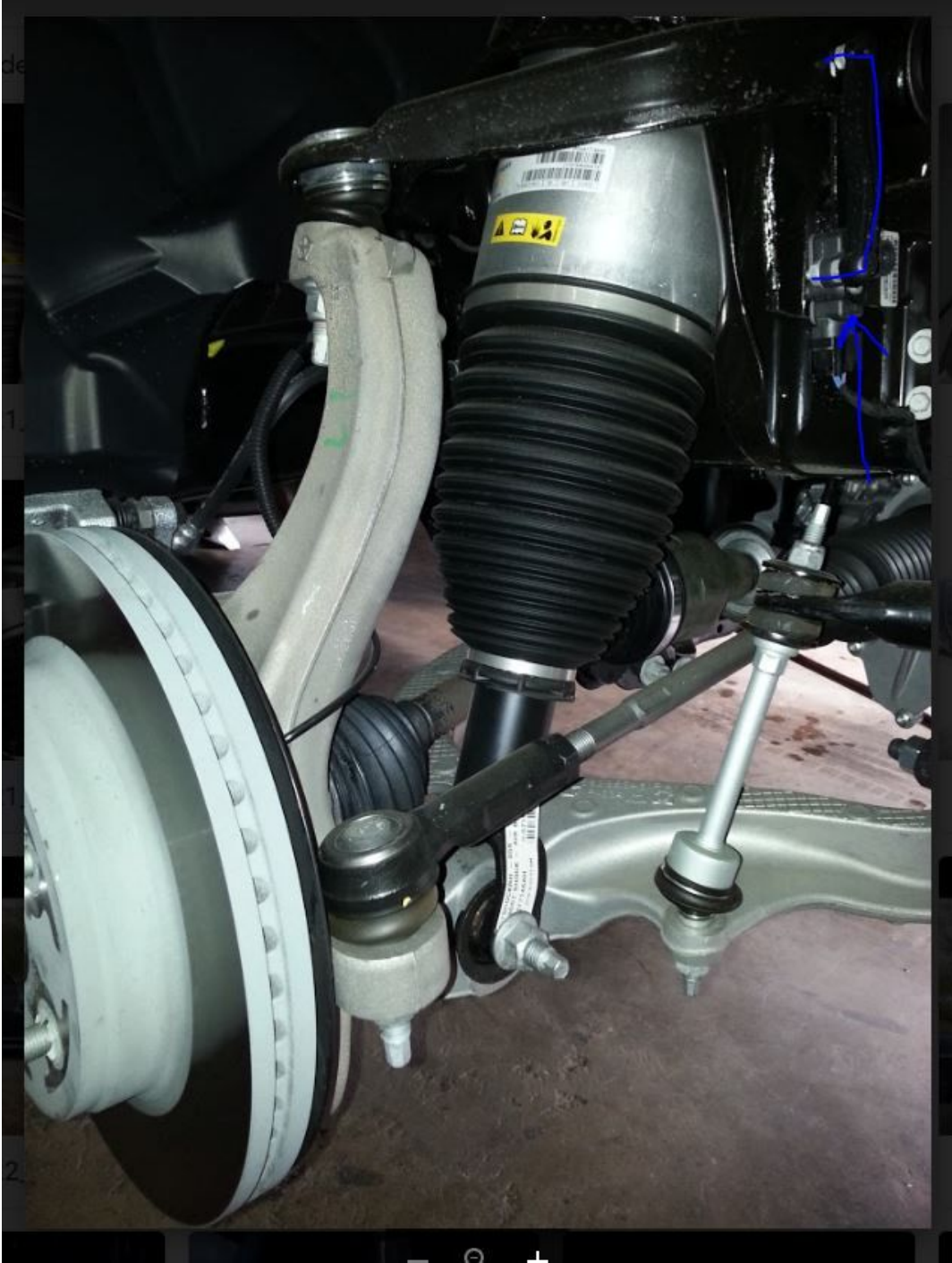
Linkage marked with blue.