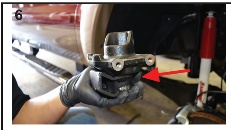
Fit Traxda Spacer underneath spring perch.