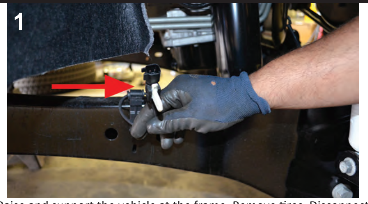
Raise and support the vehicle at the frame. Remove tires. Disconnect ABS lines at the body mount behind the front fender cover.