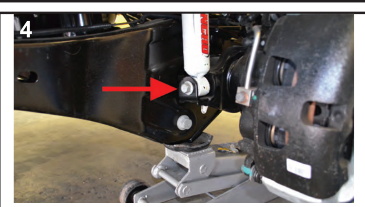
Supporting the axle with a jack, remove the lower shock mount bolt. Slowly lower the jack until the spring becomes free. Note the spring orientation for re-installation.