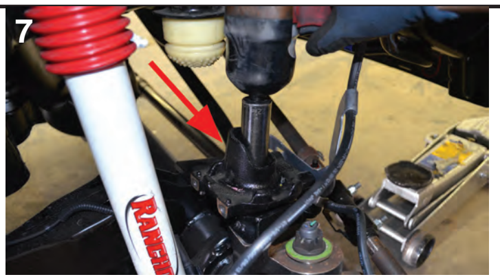
Using supplied hardware, bolt down the spring perch and Traxda Spacer. Reinstall spring, raise axle and reinstall lower shock mount bolt.