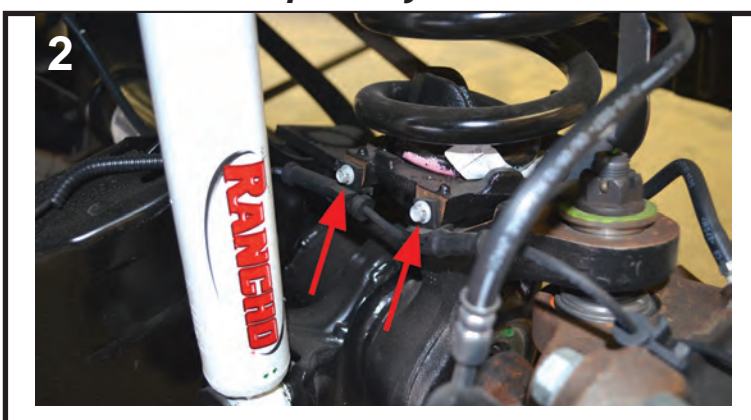
Disconnect two ABS wire mounts from backside of spring perch.