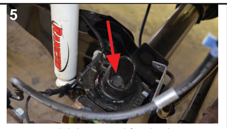
Unbolt the spring perch from the axle.